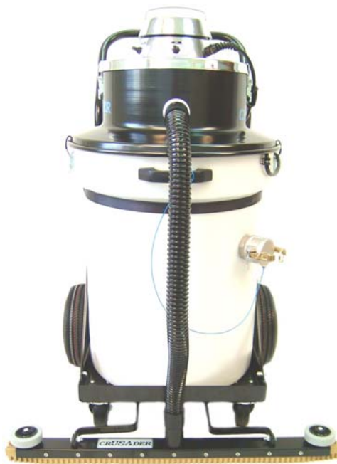
#4017-CART 30 gallon 30" Front Mount Squeegee shown on 30 gallon