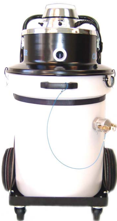
M1050-30-PUMP Shown above

The Crusader 30 Gallon Continuous Pump-out Vacuum is great for pumping into a containment truck or tank outside while you continue to work inside. This vacuum can pump while you vacuum, or can pump when you're done vacuuming. The pump-out vacuum is great for pumping down one or more flights of stairs instead of trying to wheel a vacuum tank full of concrete slurry down a stairs. Save on workers compensation from employees hurting their backs while lifting heavy barrels full of concrete slurry - PUMP IT OUT!